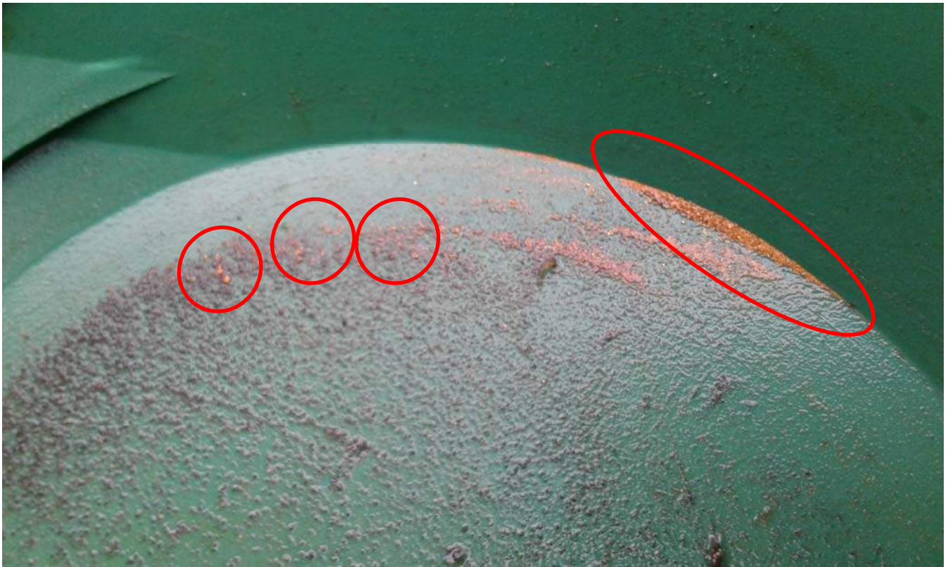
Photo 2: Thousands of gold grains (in red ellipse) panned from carbonate-bearing biotite-altered mafic rocks from the East Rompas project. Scale of gold tail in pan approximately 4 centimetres.