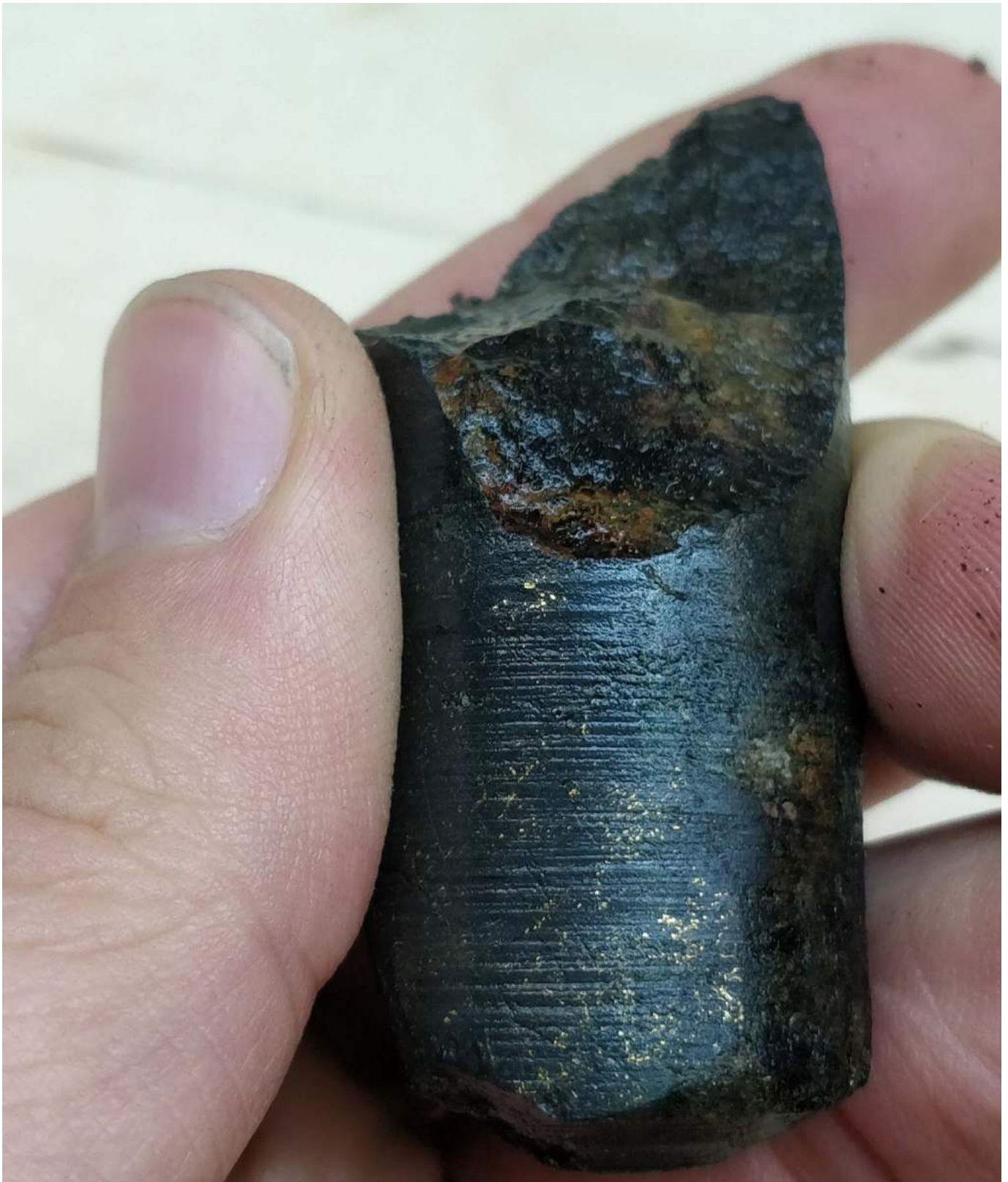
Photo 1: Extremely high-grade, visible gold from a mini-drill sample taken from the East Rompas project (minidrill diameter 25mm). No sulphides present in the sample.