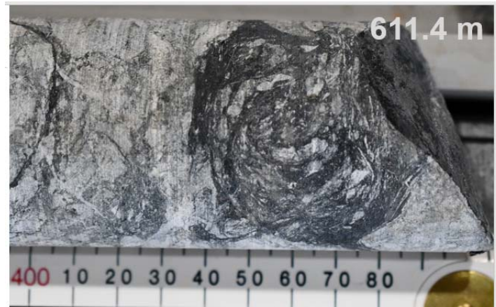
Photo 2: Rotated cataclastic "ball" comprising chlorite, graphite, quartz and carbonate from within broad faulted and veined zone of sericite-pyrite-chlorite alteration (611.4 metres).