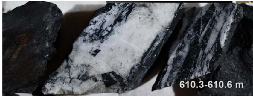
Photo 1: Quartz-carbonate-chlorite-graphite veined within zone of sericite-pyrite-chlorite alteration (from sample interval 610.3-610.6 metres).