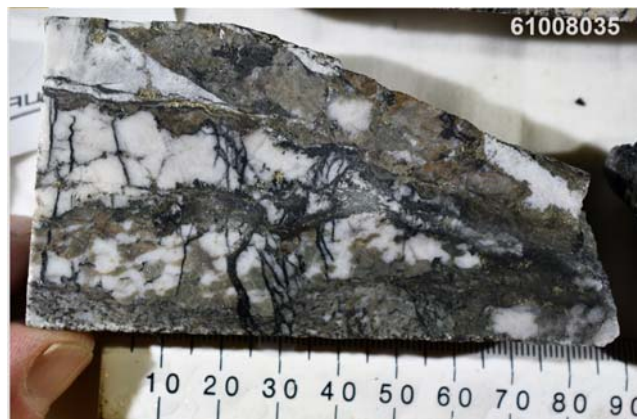
Photo 4: Fracture-controlled biotite-sericite-pyrite alteration with trace chalcopyrite associated with quartz-carbonate veining from sample interval 832.1-832.5 metres (0.22 wt % Cu).