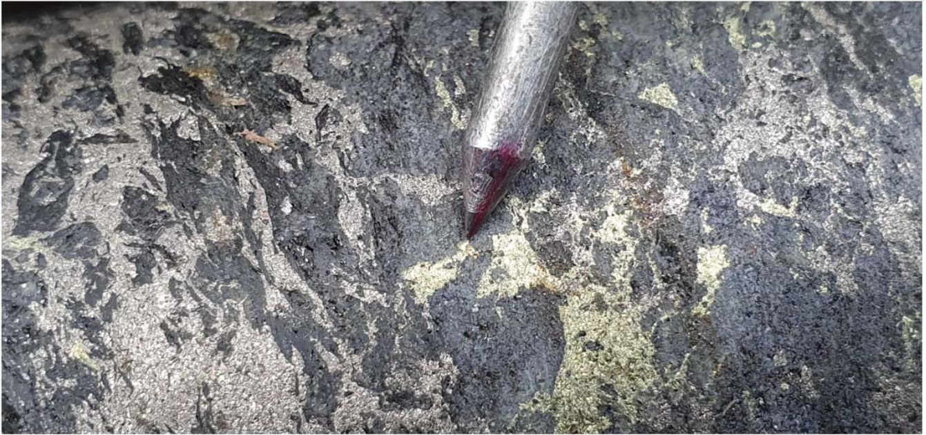
Photo 2: PAL0242 at 155.9 metres showing visible gold grain. The interval from 155.0-156.0 metres (1.0 metres length) assayed 26.0 g/t gold. Scale of core is NQ2 (50.7 mm diameter).