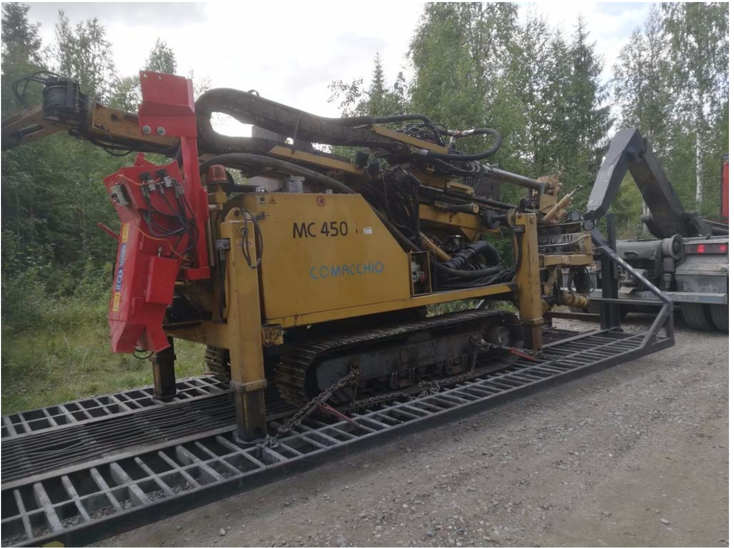
Figure 3: RC Drilling rig mobilized to site at Rompas