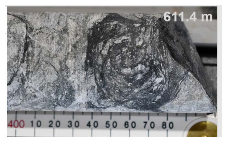
Photo 2: Rotated cataclastic "ball" comprising chlorite, graphite, quartz and carbonate from within broad faulted and veined zone of sericite-pyrite-chlorite alteration (611.4 metres).